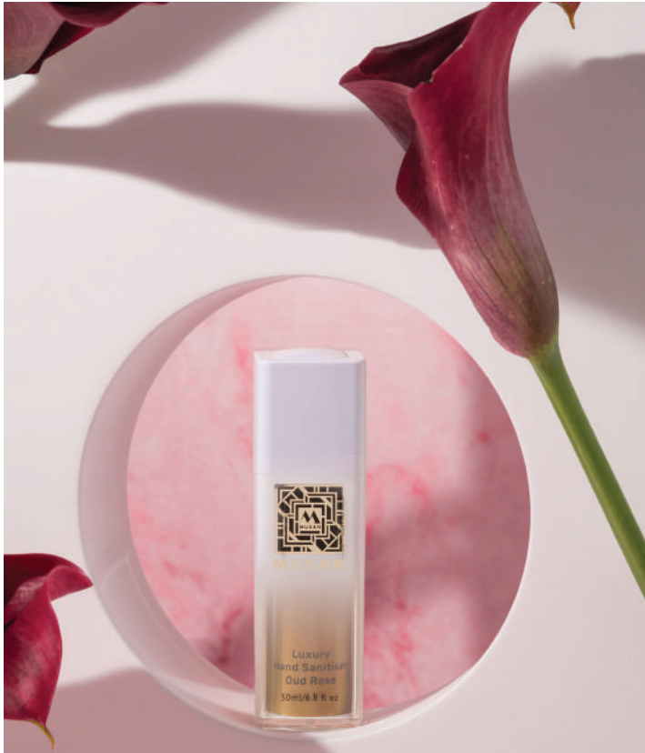
Oud Rose 30ml Travel size RRP £15.00 (GBP)